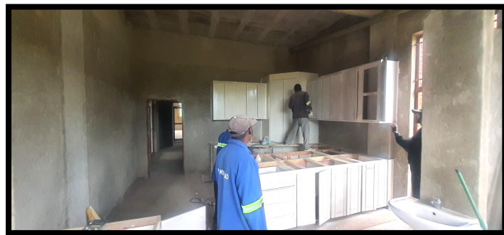
Kitchen Cabinets – installed & painted

Thanks to recent fundraising efforts and our regular financial supporters, furnishing the college has begun. The grand opening of the lower level of the campus is slated for January 2026. As of now, the bathroom fixtures are in. The kitchen sinks are in, and the cabinets are being built. Furniture for the first classroom is on order. However, we still need many more fixtures in order to launch the first semester. We are excited to see the place fill up with all the equipment needed to train potential pastors and church planters.