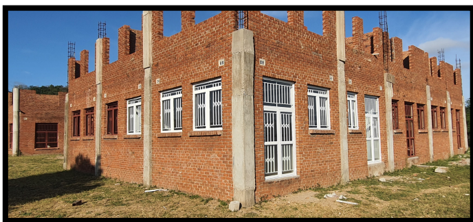
Classroom windows are complete