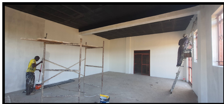
Classroom walls are painted