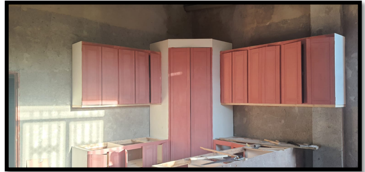
Kitchen Cabinets – installed and painted

Thanks to recent fundraising efforts and our regular financial supporters, furnishing the college has begun. The grand opening of the lower level of the campus is slated for January 2026. As of now, the bathroom fixtures are in. The kitchen sinks are in, and the cabinets are being built. Furniture for the first classroom is on order. However, we still need many more fixtures in order to launch the first semester. We are excited to see the place fill up with all the equipment needed to train potential pastors and church planters.