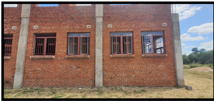
Classroom windows are installed